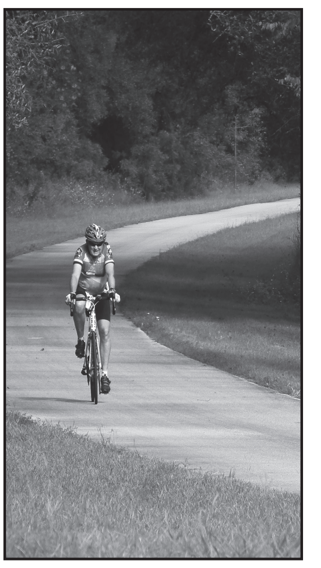
One of Florida's longest rail-trails