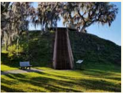
Temple Mound A, the largest mound at the Archaeological site. Observe the salt marsh and Crystal River from the platform or picnic along the river nearby.