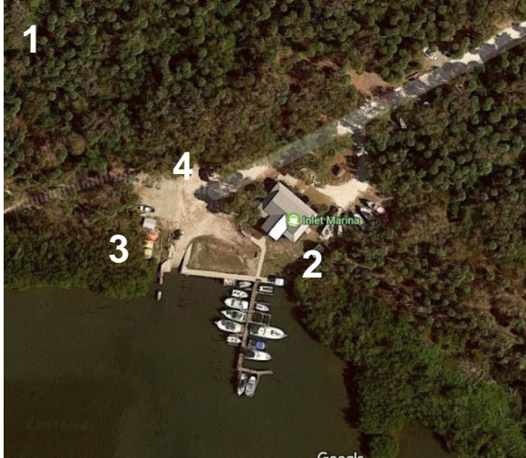
EXHIBIT I Area Map